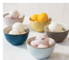
SAN FRANCISCO TREATS From left: Dishes from the Tartine Manufactory cafe; Tartine Cookies & Cream served in custom Heath Ceramics bowls.